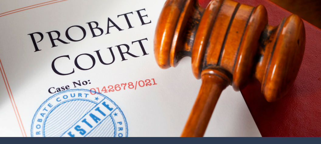
CLAIM: Probate must be avoided. (continued)

In Maryland, for example, the probate fee for an estate of between $500,000.00 and $750,000.00 is $750.00 (based on 2020 rates). The cost of preparing a federal estate tax return and a fiduciary income tax return (which may both have to be prepared, regardless of whether a will or a revocable trust is used) could be several times the cost of the probate fee.